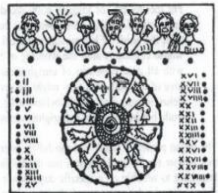
Roman Stick Calendar

Saturday, (or dies Saturni - the day of Saturn) was the very first day of the week, not the seventh. As the god of agriculture, he can be seen in this preeminent position of importance, holding his symbol, a sickle. Next, on the second day of the pagan planetary week, is seen the sun god with rays of light emanating from his head. Sunday was originally the second day of the planetary week and was known as dies Solis. The third day of the week was dies Lunae (day of the Moon - Monday). The moon goddess is shown wearing the horned crescent moon as a diadem on her head. The rest of the gods follow in order: dies Martis (day of Mars); dies Mercurii (day of Mercury); dies Jovis (day of Jupiter); and dies Veneris (day of Venus), the seventh day of the week. 22